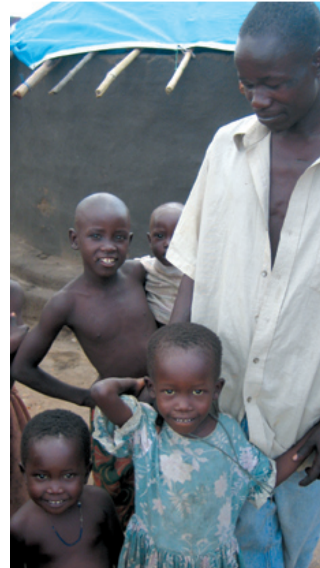
ARC is helping build hope and opportunity for this family in Pawel, Uganda.