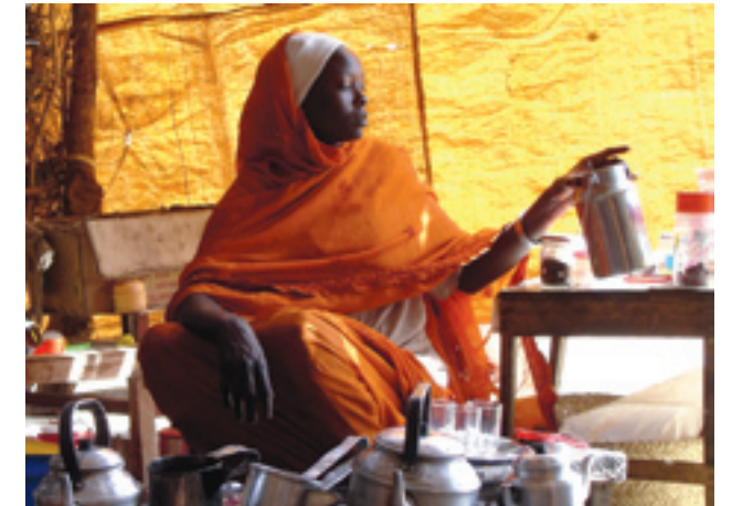
In conflict areas, displaced people such as this woman, who runs a coffee stand, take comfort in maintaining the routines of normal life.

your help to continue pursuing the following objectives with the communities we serve: