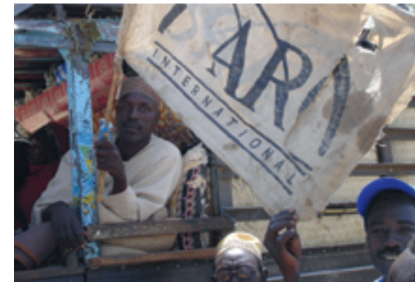
In Darfur, Sudan, 300 farmers improved their yields with quality seeds and simple tools provided by ARC.

Current Events Class at Pfeiffer College