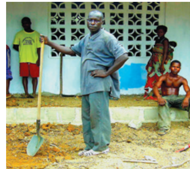
At the persistent requests of their children, the residents of Balama, Liberia, made building this school their top priority upon returning to the town after Liberia's civil war.

We are helping Liberians help themselves. Thank you.