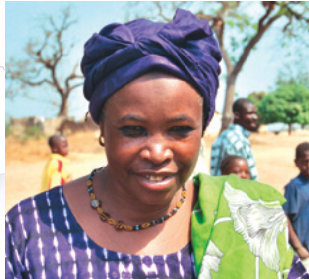
The majority of ARC's microcredit beneficiaries are women. Micro-loans and business training help women whose husbands were killed in conflict provide for their families.

14,000 small business owners through eight branches across the country. Your gifts made it possible!