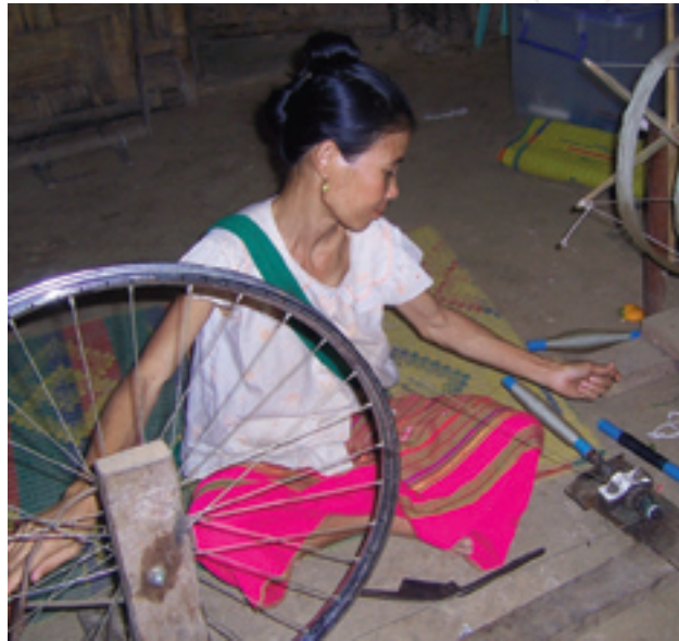
Resourcefulness is an essential characteristic for refugees. This woman is using an old bicycle wheel as a loom.

We continued to partner with Right to Play to bring sports and games to kids – opportunities for recreation are scarce in a refugee camp. We incorporated health information into the games. “Mosquito tag” was created to teach kids how to protect themselves from malaria.