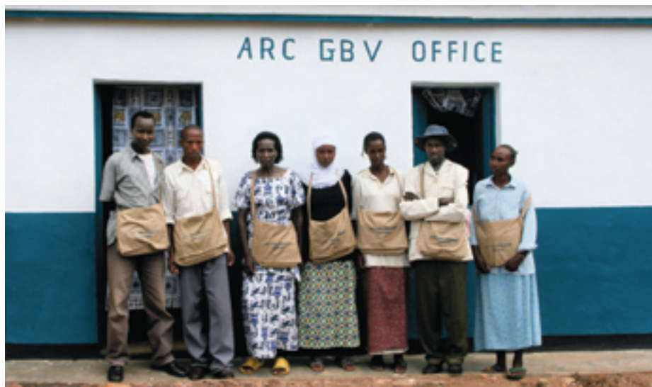
ARC empowered 35,000 women in Guinea by educating them on their right to be safe from gender-based violence.