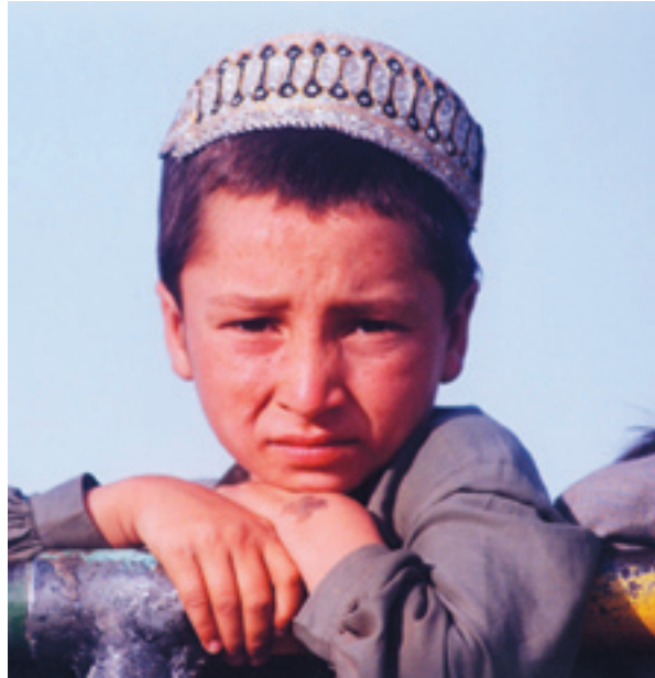
In 2006, ARC provided health care to nearly 100,000 Afghan refugees in Pakistan.