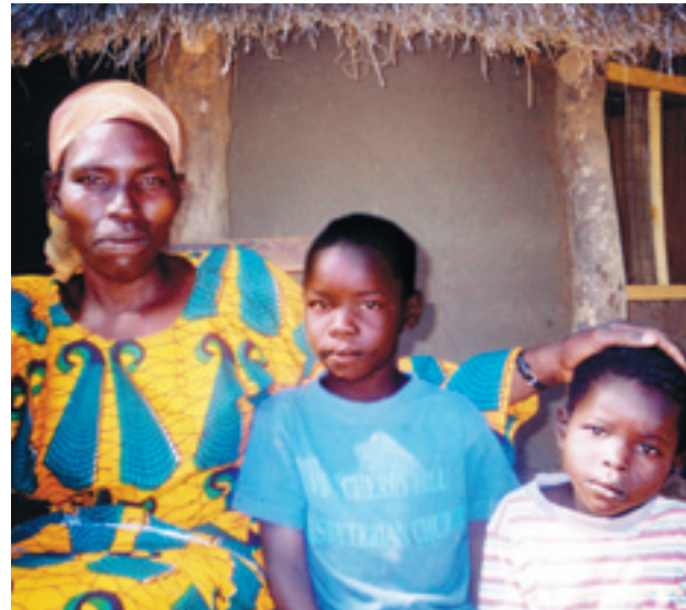
For families in South Sudan, ARC is an important source of education.

In 2006, 44 ARC health centers provided medicine and health education to communities in Magwi, Yei and Kajo Keji counties – increasing the quality and accessibility of health services for tens of thousands. Services include: immunizations, antenatal services for mothers and