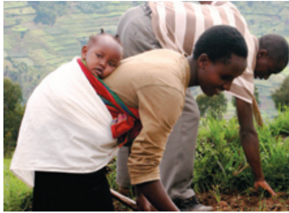
In 2006, ARC helped nearly 3 million people in ten countries take back control of their lives.