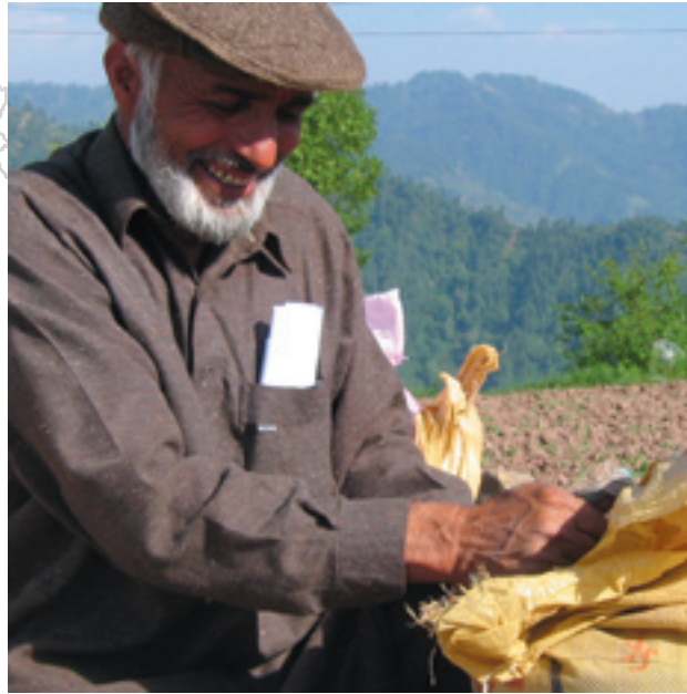
ARC distributes high-yield seeds, fertilizer and tools to help farmers who have lost everything get back on their feet.

In the south, we continued our work with Afghan refugees living in the Balochistan province of Pakistan. ARC operates seven health centers in Balochistan, caring for more than 170,000 refugees last year. Our emergency childbirth facilities are open 24 hours a day, seven days a week.