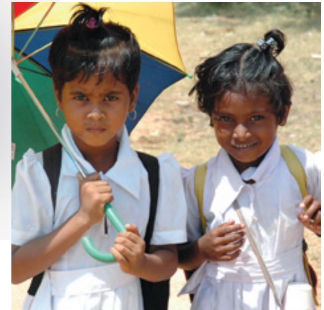
ARC's vaccination campaigns, nutrition programs and opportunities for fun and games improve the lives of hundreds of thousands of children each year.

ARC collaborated with the Sri Lanka Department of Agriculture to give hundreds of farmers future food