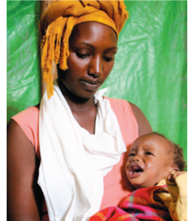
ARC’s reproductive health programs in Rwanda help mothers and their babies get the care they need, before, during and after delivery.

As long as eastern Congo remains unstable and in conflict, the camps will remain. In 2007, ARC continues to work to ensure essential health care, water and sanitation, infrastructure and income generation opportunities are available in the camps. If conditions can stabilize, prospects for repatriation will improve