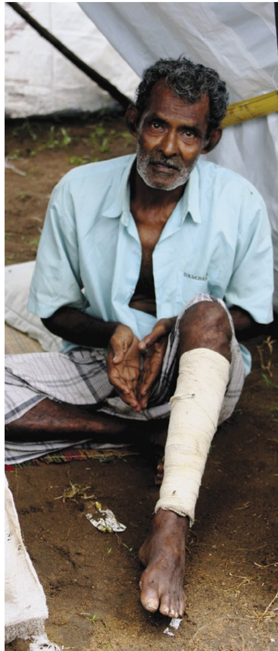
right: This man was injured and forced to flee when the Tsunami struck his home in Sri Lanka.

Together with tsunami survivors and individual donors, ARC created the Fishing Boat Project. By the end of 2005, more than 400 fishermen in southern Thailand had a new boat and could support themselves again. In Sri Lanka, ARC distributed relief items and small grants to help people restart their businesses and rebuild community buildings.